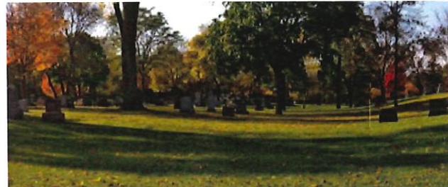
PRECEDENT AT LAKEWOOD CEMETERY - ROAD CLOSURE WITH FLUSH MARKERS