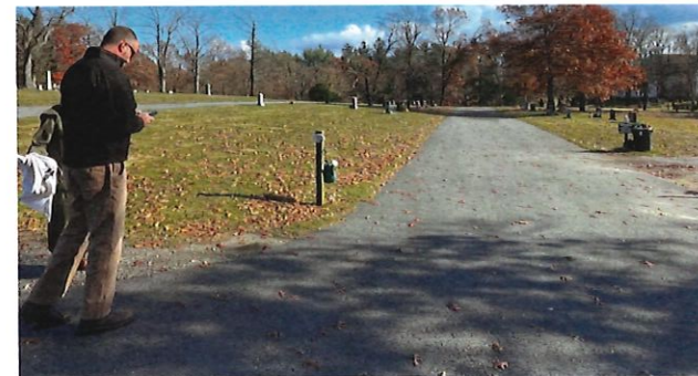
PROPOSED AREA FOR ROAD CLOSURE IN AREA A