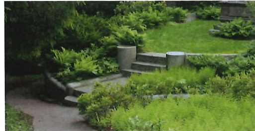
PROPOSED STEPS WITH RETAINING WALL COMMUNAL MARKERS BEHIND WALL IN AREA B